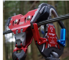
Compatible with majority of Karabiners/Snaphooks & with ISC SmartSnap System

Durable Acetal end stops protect the trolley frame. Zippey can be supplied with standard, flat end stops, or is available with hooked end stops (as an optional extra), onto which you can mount a secondary lanyard.